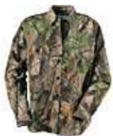
men's & women's $16 each

The lightweight cotton makes Stalker Lite clothing extremely breathable. These shirts are ideal for early-season hunting. Hunting is no fun when you're sweaty and uncomfortable. This lightweight, breathable 100% cotton fabric will keep you cool. Try our Stalker Lite camo - and feel the difference for yourself! Imported.