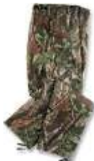
Realtree Hardwoods Green HD™

4" adjustable waist tabs offer a comfortable, custom fit. Features: 2 front slash pockets, 2 large bellows cargo pockets and 2 back pockets. Ribbon-cuff ties seal out debris. Inseam: 32".